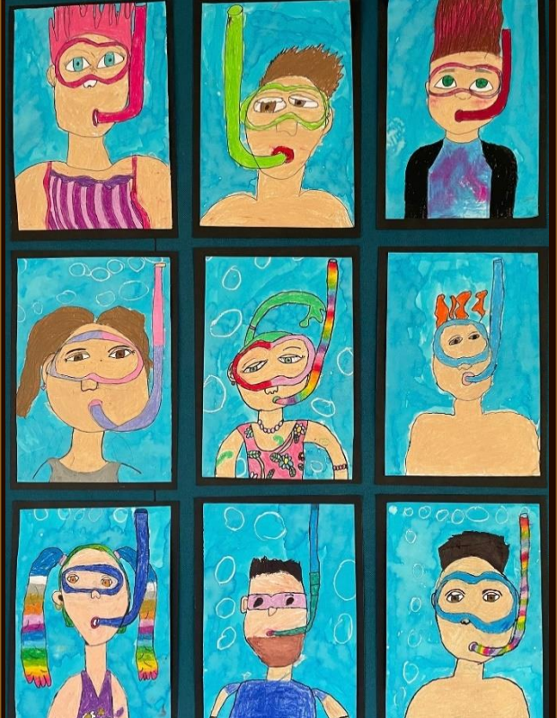
Amazing Art from Room 15

Thank you for supporting this fundraiser.