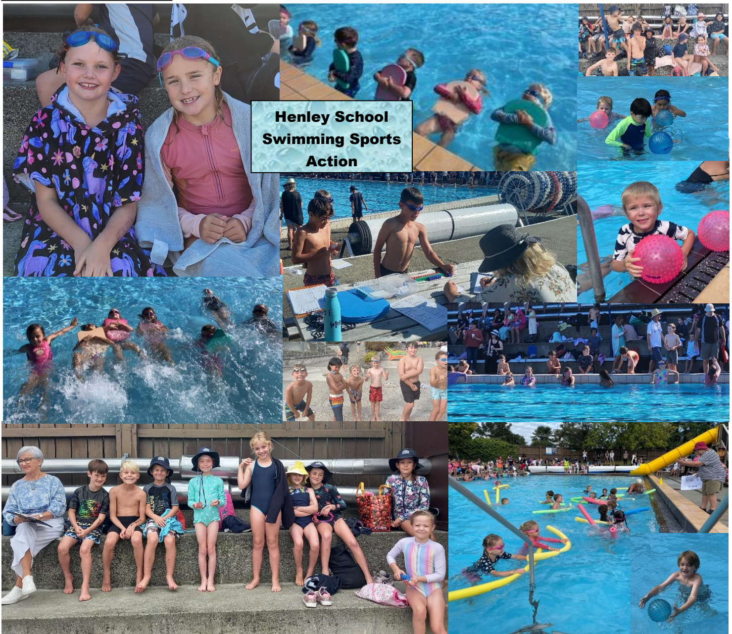
Henley School Swimming Sports Action

I Remember Swimming My eyes saw people gliding through the cold shiny water. My ears remember the kids chattering like squawking birds along the pool side. My arms remember gliding through the shimmering water. My legs remember kicking as fast as a cheetah. My heart remembers pounding nervously. My lungs remember taking a deep breath before diving under the water. By Thea S. Rm 13