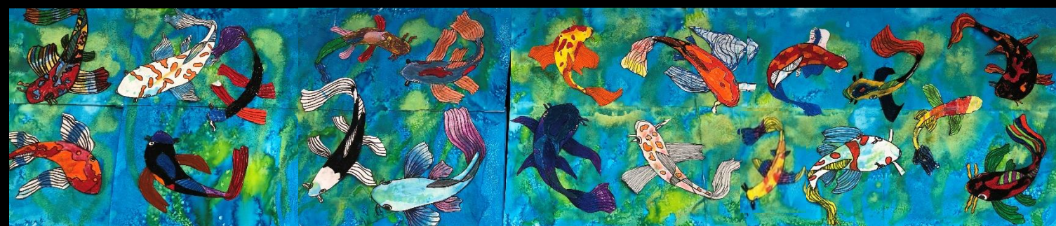
What an amazing piece of Koi Fish collaborative art work from Room 7!

You will receive a letter in Week 1 next term inviting you to the information evening. Please save the date.