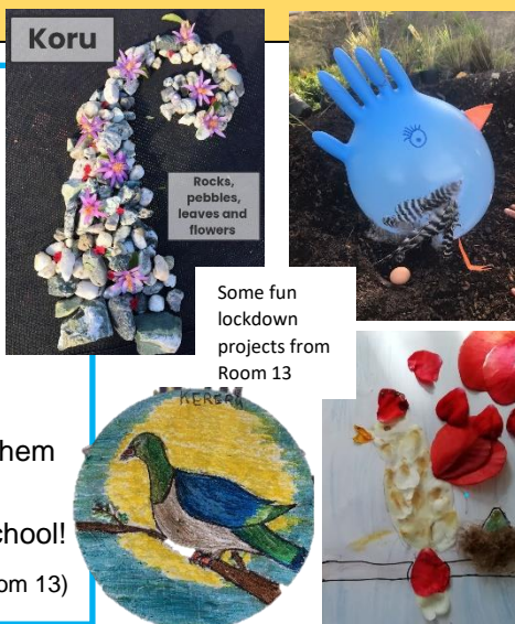
Some fun lockdown projects from Room 13