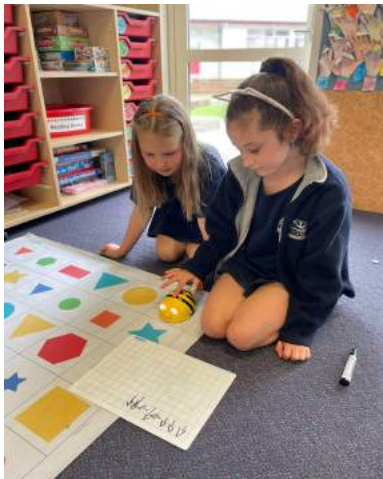
Room 10 students enjoying writing algorithms for the Beetbots.